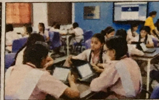
टैब आधारित कक्षाएं